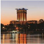
Moevenpick Resort Aswan